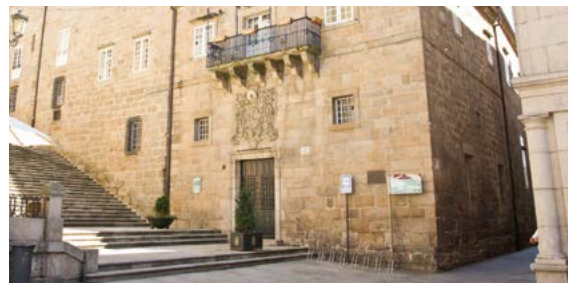
CENTRE OR THE ARCHAEOLOGICAL MUSEUM