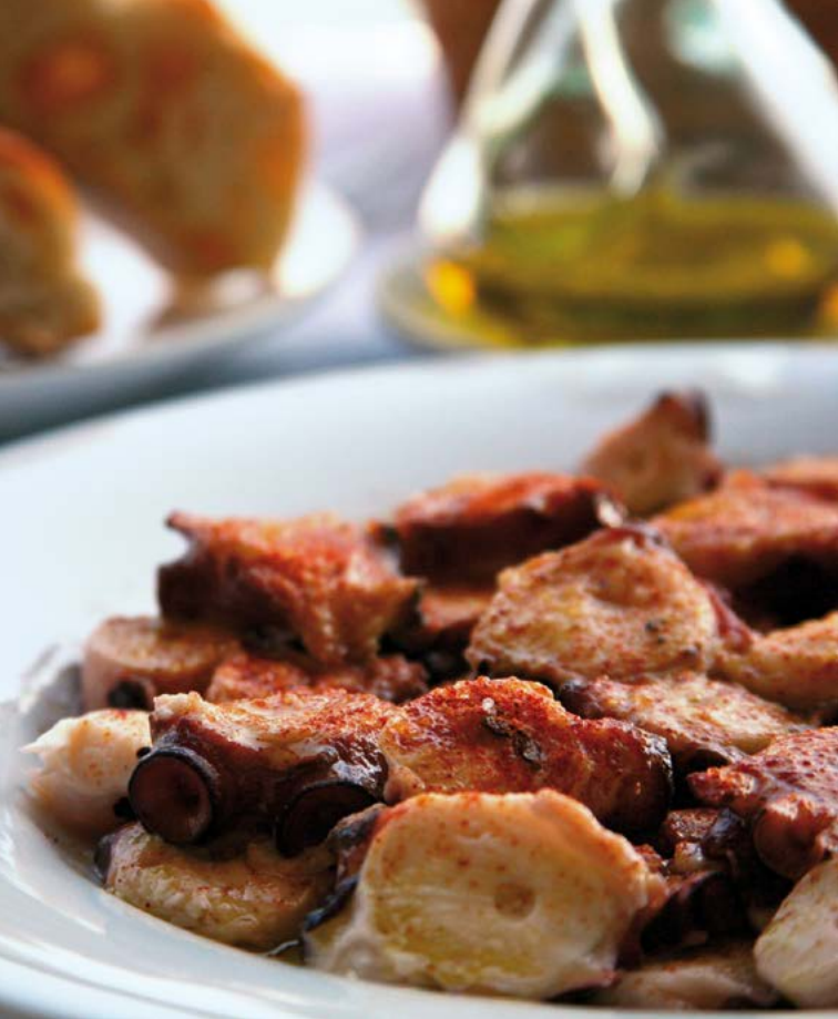
"PULPO Á FEIRA" (OCTOPUS)

of this gastronomic heritage. Another mouth-watering option is the haute cuisine and signature restaurants which are located throughout the city and the metropolitan area.