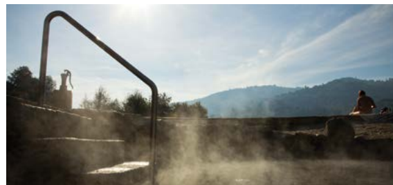
MUIÑO DA VEIGA HOT SPRINGS

Thermal bathing area located in river Minho's basin, at the foot of an old water mill. It has various free pools adapted for bathing surrounded by a large recreational area in a natural environment. The waters flow at temperatures between 61° and 69°. There are toilets, changing rooms, wifi and parking areas.