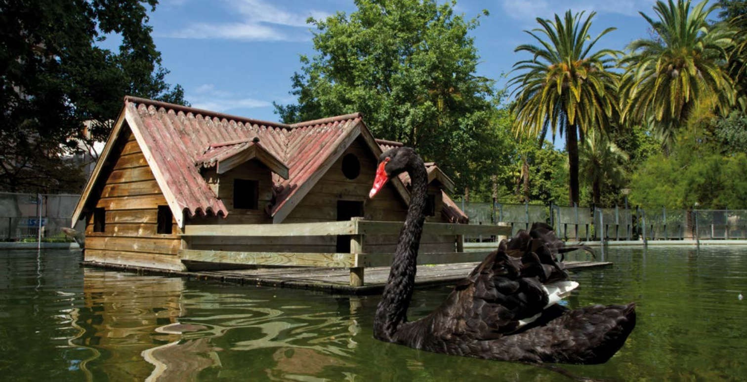
O POSÍO GARDEN PARK