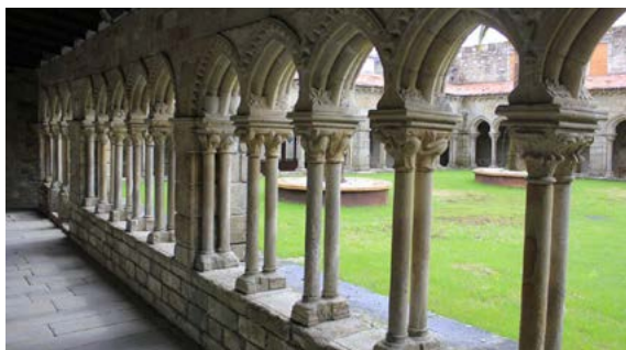
SAN FRANCISC' CONVENT

In the upper part of the city lies San Francis' Convent. Its 14th century Romanesque-to-Gothic cloister, which is one of the most representative and well-conserved in Galicia, can be visited. Nearby is the hostel for the pilgrims on the Way to Santiago.