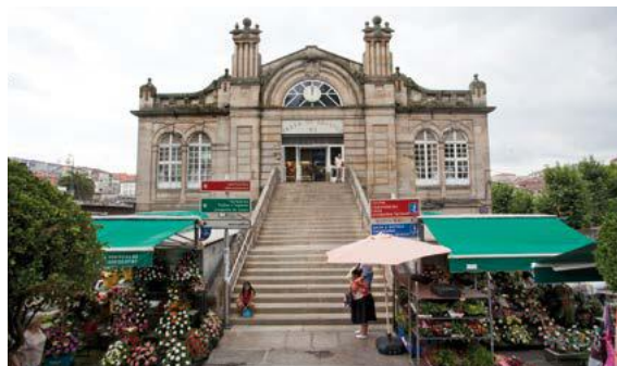
PRAZA DE ABASTOS (FOOD MARKET)