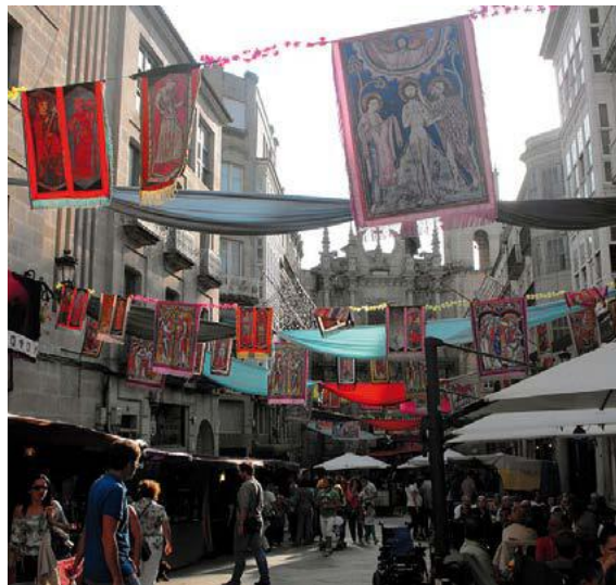
"FESTAS GRANDES". MEDIEVAL MARKET

The city's residents prepare sculptures with autochthonous vegetation (moss, flowers, etc.) and recite "coplas" (satirical songs) that they have composed themselves.