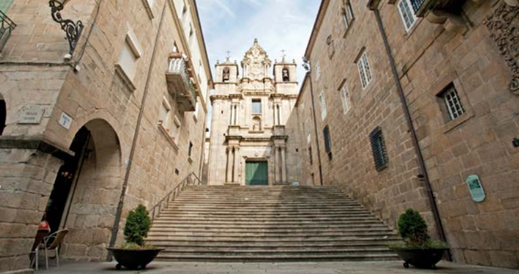
SANTA MARÍA NAI CHURCH