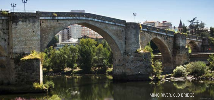
MIÑO RIVER. OLD BRIDGE