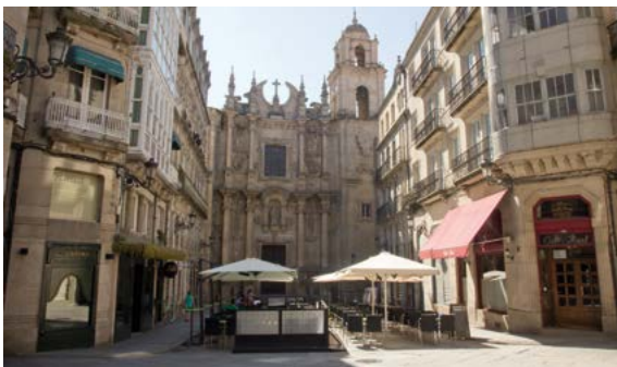
SANTA EUFEMIA SQUARE

Hometown of great writers such as Eduardo Blanco Amor, Ramón Otero Pedrayo, Vicente Risco and José Ángel Valente, Ourense has provided inspiration for the great Galician literary movements, like the Xeración Nós, and preserves some areas very connected to this literary tradition like Paz Street or the "Liceo" (Lyceum) society, located at the Oca-Valladares Palace, one of Galicia's most important Renaissance monuments.