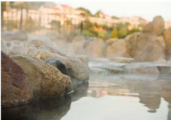
A CHAVASQUEIRA BATHS

A Chavasqueira Baths: natural pools adapted for bathing. They have locker rooms, toilets, parking areas, bicycle rental and wifi.