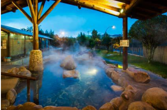
A CHAVASQUEIRA SPA STATION