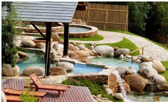
OUTARIZ SPA STATION