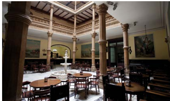
PAZO DE OCA-VALLADALES. LICEO

Hometown of great writers such as Eduardo Blanco Amor, Ramón Otero Pedrayo, Vicente Risco and José Ángel Valente, Ourense has provided inspiration for the great Galician literary movements, like the Xeración Nós, and preserves some areas very connected to this literary tradition like Paz Street or the "Liceo" (Lyceum) society, located at the Oca-Valladares Palace, one of Galicia's most important Renaissance monuments.