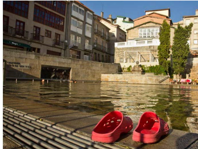
THE BURGAS POOL

Hot spring waters located at to the city's historical centre. The most popular source is the Burga de Abaixo (Lower Fountain), a symbol of the city designed by architect Trillo in the mid-19th century. The water, declared as mineral-medical, flows at 65°.