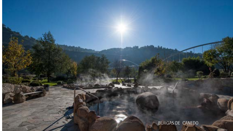
BURGAS DE CANEDO

Untes Campsite: Only 3.7 km from Outariz, the Untes Campsite offers both space for camping and bungalows, and is totally adapted for people with reduced mobility.