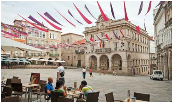
PRAZA MAIOR (MAIN SQUARE)