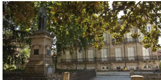
THE PROVINCIAL COUNCIL CULTURAL CENTRE AND PADRE FEIJÓO GARDEN